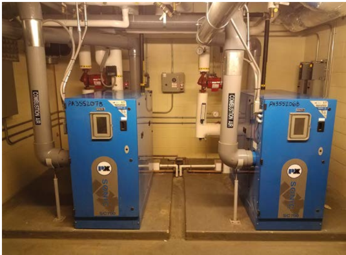
New Patterson Kelly boilers were installed at Homestead Village.