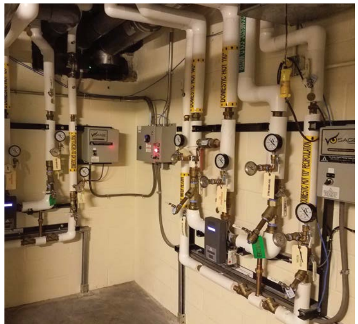
Homestead Village was upgraded with Armstrong digital mixing centers.