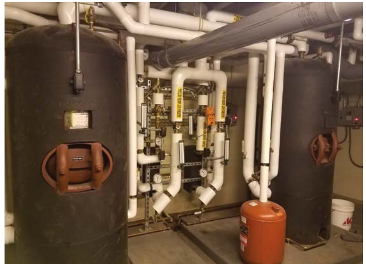
Domestic hot water storage tanks and heat exchangers were also installed.

H omestead Village is an exceptional Life Plan Community situated on 90 beautiful, tree-lined acres, conveniently located in the heart of Lancaster County. Proud of its strong values and rich heritage, Homestead Village strives to enhance the everyday lives of its residents.